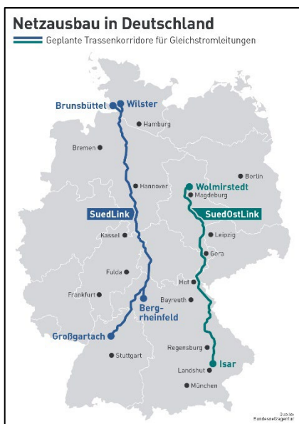
Illustration: STRABAG AG / Source of information: Bundesnetzagentur (Federal Network Agency for Electricity, Gas, Telecommunications, Posts and Railway)

The grid operators TransnetBW, TenneT and 50 Hertz plan to use the SuedLink and SuedOstLink power transmission corridors to transport renewable energy from northern and eastern Germany to the south of the country.