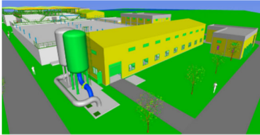
3D rendering of drinking water treatment plant (outside view).

hard work and dedication of our more than 75,000 employees allow us to generate an annual output volume of around € 16 billion. At the same time, a dense network of numerous subsidiaries in many European countries and on other continents is helping to expand our area of operation far beyond the borders of Austria and Germany. More information is available at www.strabag.com .