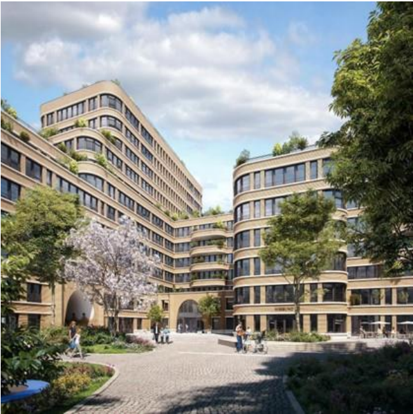
Courtyard view, B'Ella Berlin